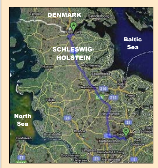
Our first stop was Fredesdorf, the birthplace of Henry Finnern. Fredesdorf ("B") is located about eighty-six miles southeast of Flensburg ("A").

Seconds before I left the house the happy UPS man showed up at our doorstep. I opened the bright red folder, read the first three pages, and immediately phoned Boedee Böttcher in Herrenberg